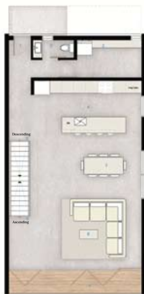
3rd Floor (Access Level)