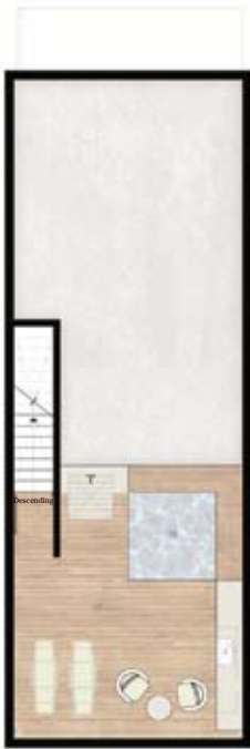
Upper Terrace Level