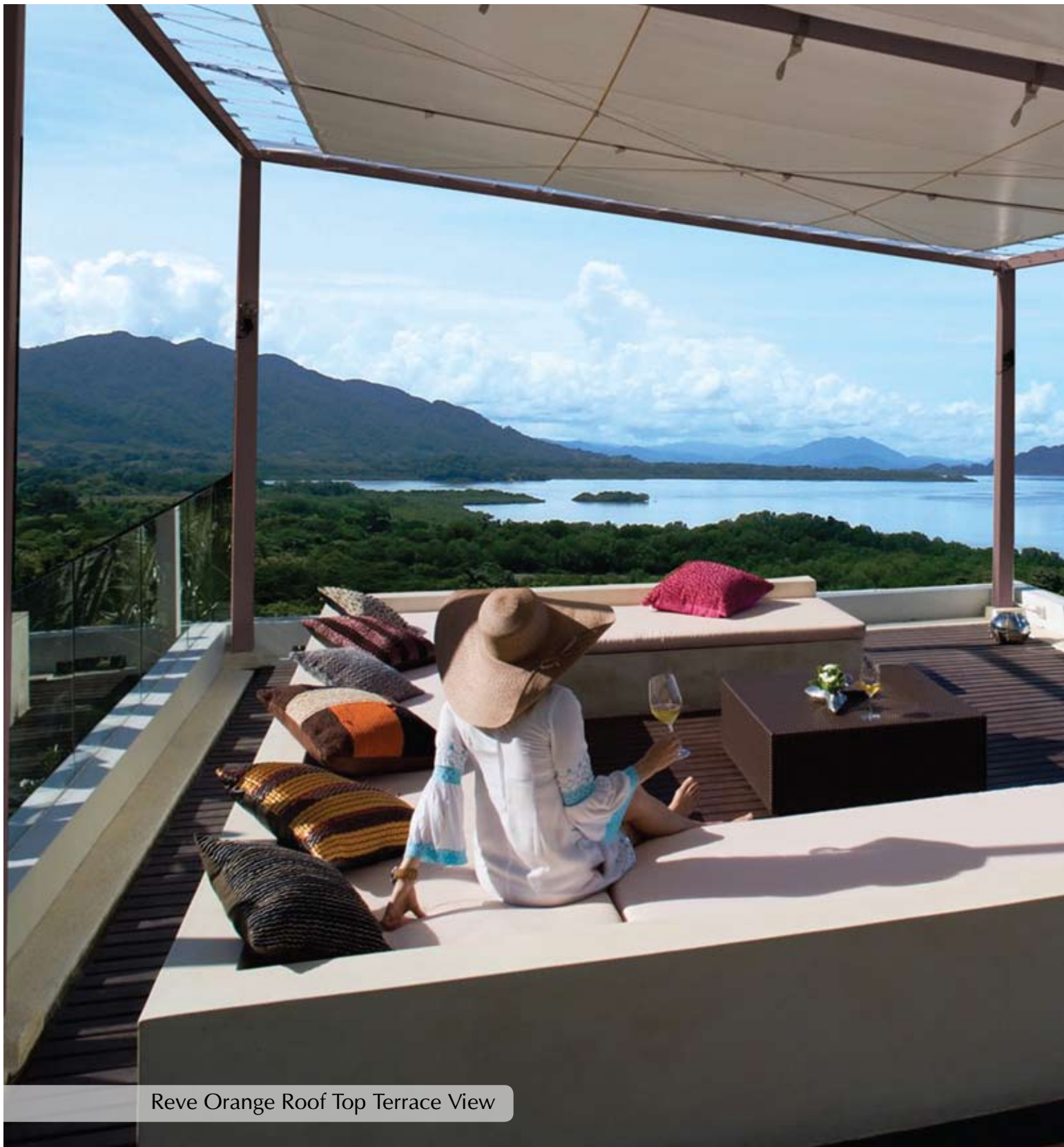
Reve Orange Roof Top Terrace View